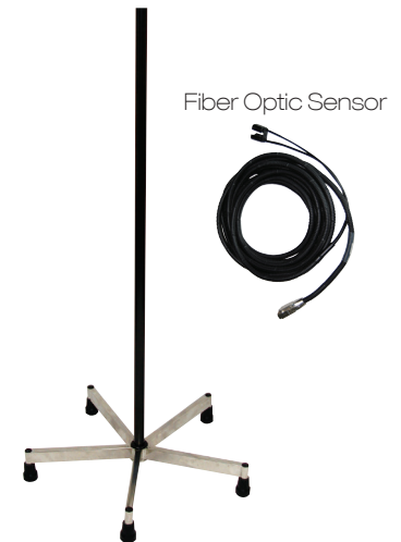
Pole mount hardware included on OX-1061 & OX-1062