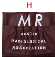
Custom Stenciling, add your company name and/or other info on back of wheelchair