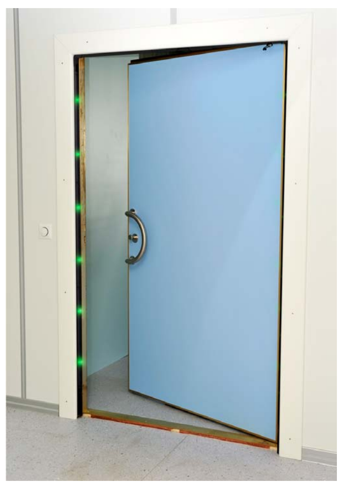
FerrAlert™ HALO II - Built-In configuration.

Photoelectric Sensors: Activates Audio Alarm only when portal threshold is crossed by a ferromagnetic threat, and only on objects entering the MRI room; not on exiting