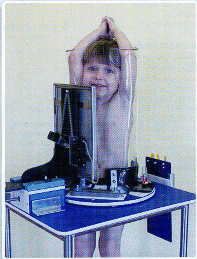
ORIGINAL ANALOG PIGG-O-STAT ® Sold worldwide since 1961 Patent # 5,600,702