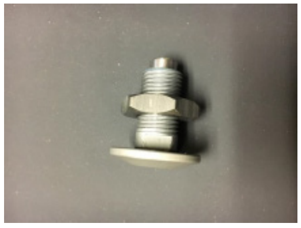
Step 5: Reinstall the housing to the correct or desired depth. Once the correct depth has been determined adjust the locking nut flush with the frame by hand.